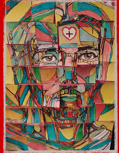
IMAGE OF CHRIST ART PROJECT LADIES RETREAT