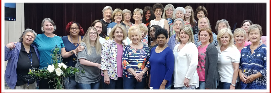
LADIES RETREAT, MAY 2019